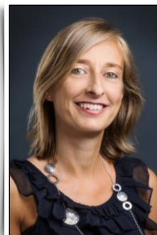
Quality Assurance & Regulatory Expertise