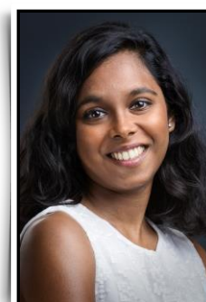
Quality Assurance & Regulatory Expertise